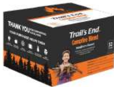
Campfire Blend Coffee K-Cups 32 cups