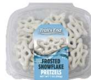
Frosted Snowflake Pretzels