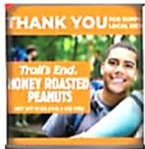
Honey Roasted Peanuts