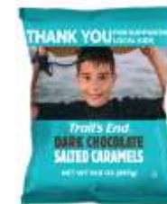
Dark Chocolate Salted Caramels