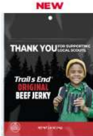
Original Beef Jerky