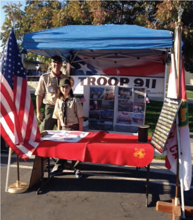
Troop 9 11 at the Hickman Harvest Festival.