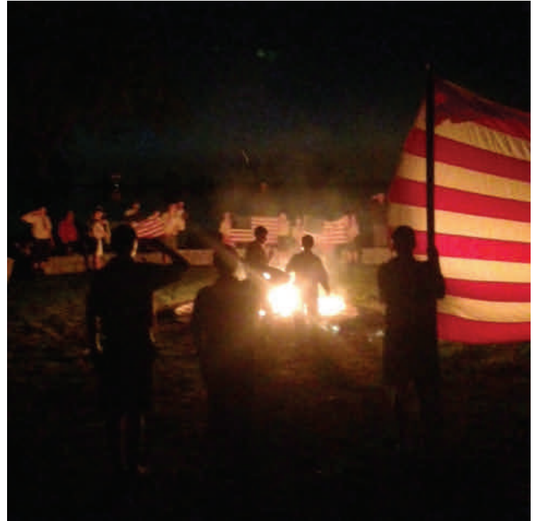
The Scouts of Troop 451 at Scout Island in Merced (shown here conducting US flag retirements following their Court of Honor).